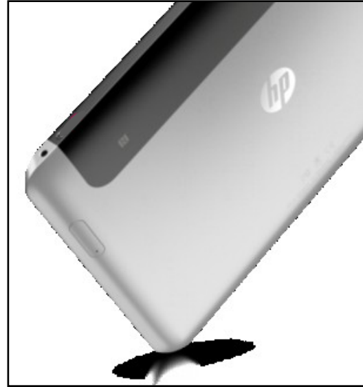
Built to Last